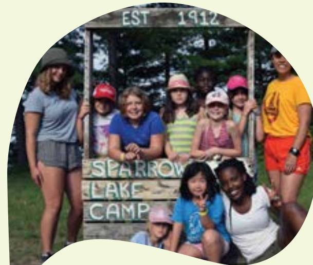
TUCC supports youth ministry by providing property for United Church camps.