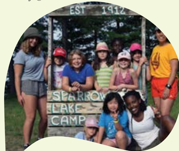
TUCC supports youth ministry by providing property for United Church camps.