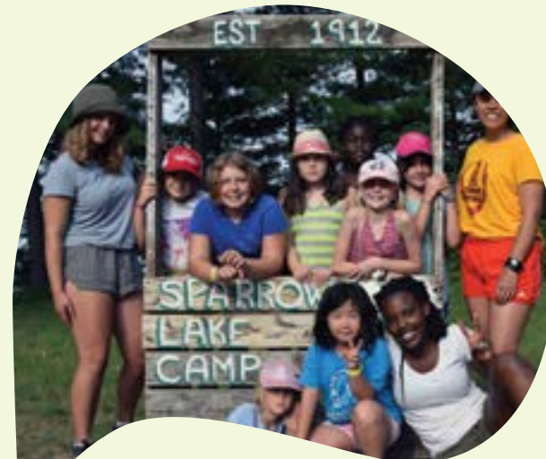
TUC supports youth ministry by providing property for United Church camps.